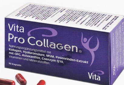
Packs of 90 capsules.